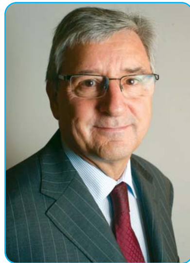
Jim Fitzpatrick MP

One of the Group's annual highlights is the House of Commons Reception. This year, it will be held on 28 November. The invitation-only event, to which representatives of all member organisations are invited, will this year welcome the Chancellor who will make an address.