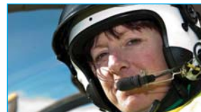
Lincs & Notts Air Ambulance Road traffic collision