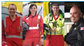
Dorset & Somerset Air Ambulance Motorcyclists' collision