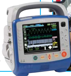
X Series monitor/defibrillator

Fluid administration is crucial to preserving cardiac output and optimising patient status. However, unnecessary fluid administration is associated with increased mortality and morbidity. PVI has been shown to predict fluid responsiveness in ventilated patients. PVI helps clinicians to non-invasively and continuously assess patients' fluid status.