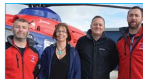
Devon Air Ambulance Trust