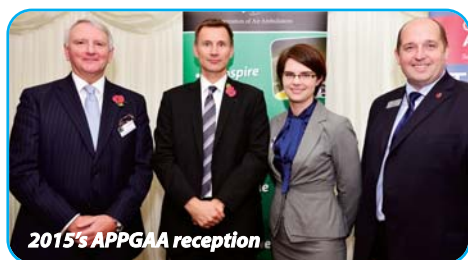
2015's APPGAA reception