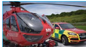
Wales Air Ambulance Industrial accident