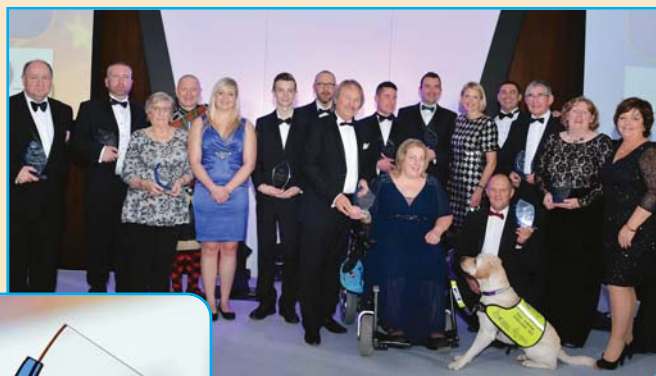
Above last year's winners.