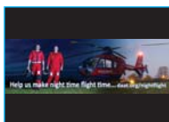
Devon Air Ambulance Trust Make Night Time Flight Time