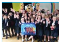
Hampshire and Isle of Wight Air Ambulance Be a 999 Hero