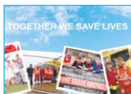
East Anglian Air Ambulance Together We Save Lives