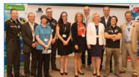
Essex & Herts Air Ambulance Trust